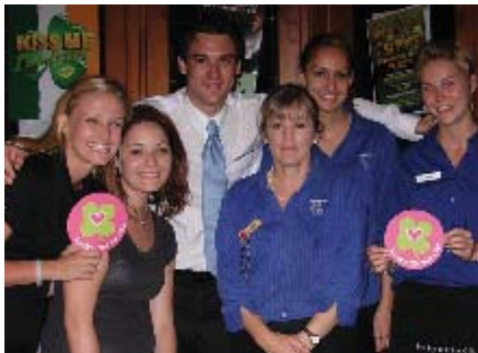
> The team at Matthew Flinders' Tom Thumb Hotel